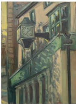
9. Daniel Kelly, View of Kettering High Street (2021)