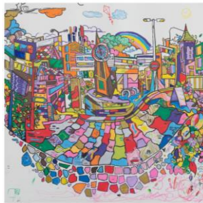
16. Marvin Mudzongo, Kettering – A Different Perspective: Bringing Colour to the High Street (2021)