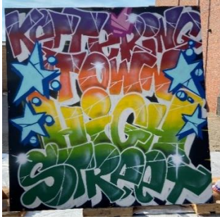
7. Krzysztof Janeczko, Photograph of Kettering High Street (2021)