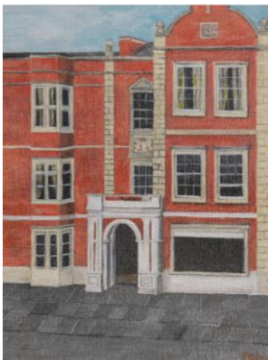
15. Michele Milroy, The Royal Hotel (2021)

Digital print created from vintage photographs taken of Newland Street and Silver Street applied to mono print text from a story by author Kathy Page, embellished with machine stitching on 300gsm Somerset cream paper. The paper was recycled from a project Kathy and Carole worked on together in the 1990s.