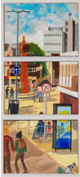
8. Rosie Jarvis, Look Up - Triptych (2021)