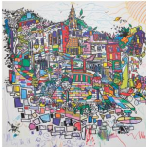
17. Marvin Mudzongo, Kettering – A Different Perspective: Bringing Colour to Market Place (2021)

This work was co-produced by local people at the Views of the High Street events in September 2021.