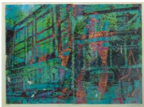
14. Carole Miles, Part of the Everyday (2020-1)

Digital print created from vintage photographs taken of Newland Street and Silver Street applied to mono print text from a story by author Kathy Page, embellished with machine stitching on 300gsm Somerset cream paper. The paper was recycled from a project Kathy and Carole worked on together in the 1990s.