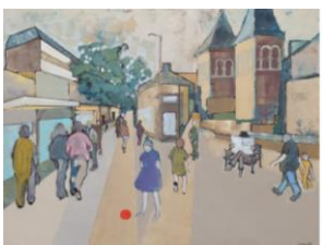
20. Jack Whatto, The Red Ball (2021)